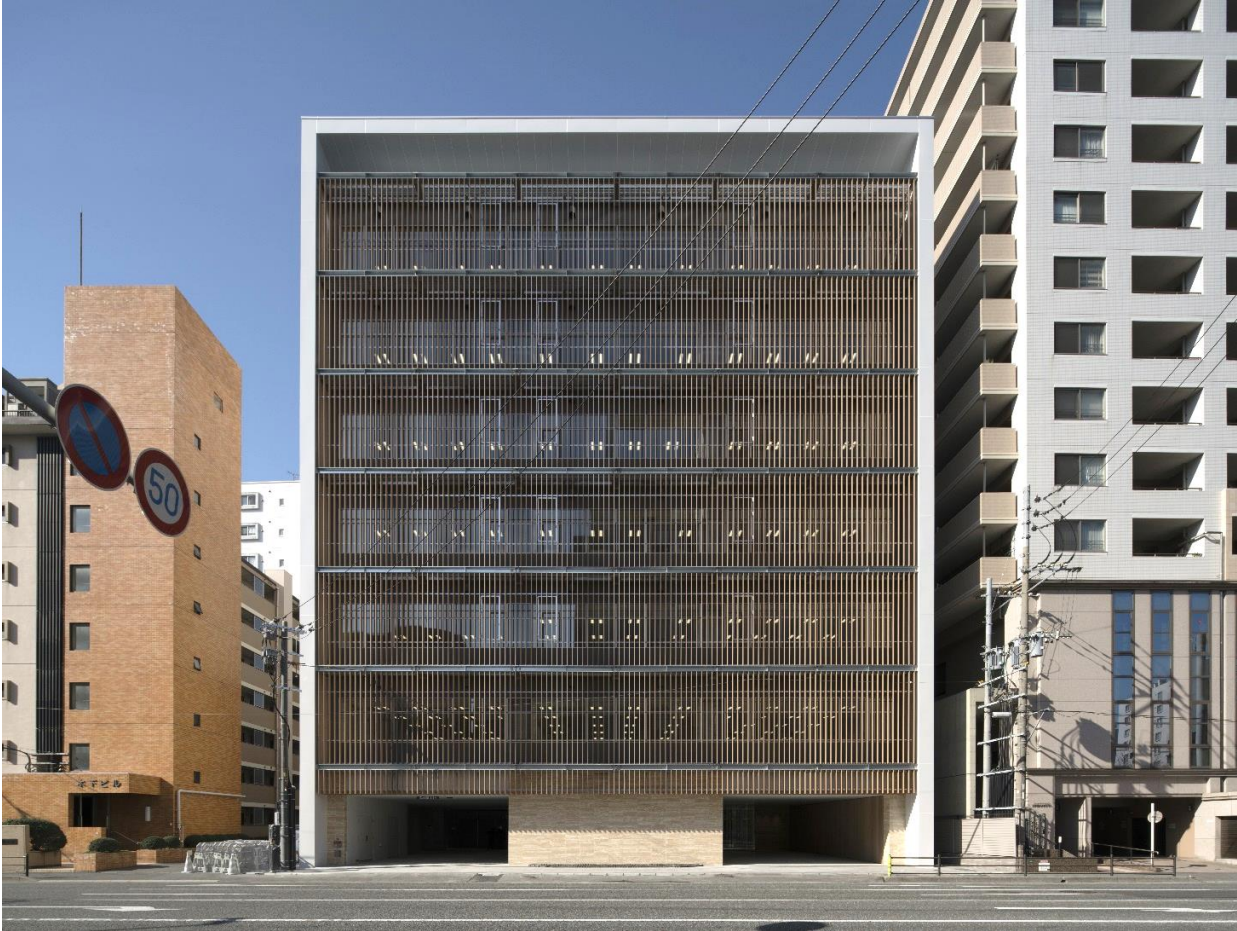
Reference 1: Outlook of the Property